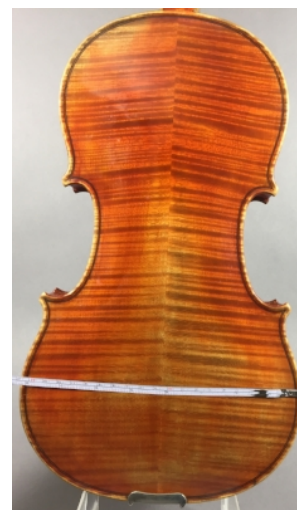
Measure the Lower Back (LB)

Try to recreate the photos shown, and make sure the pictures are well-focused and taken against a plain, neutral-colored background. Do not use flash if possible, daylight is best. Always take pictures straight at the face of an instrument, no artistic shots at an angle please. (A cropped picture from your smart phone will work).