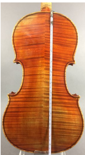
Length of Back (LOB 326mm)

Please give any details you have regarding the instrument, including its history, the measurements of the instrument in millimeters (mm), and any documentation that would be useful for us for evaluation.