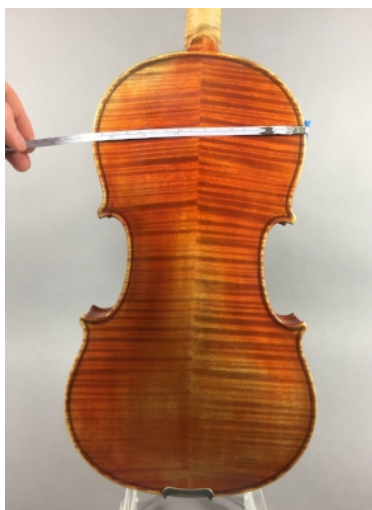
Upper Back (UB 107mm)